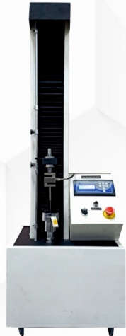
DIGITAL PUNCTURE RESISTANCE TESTER