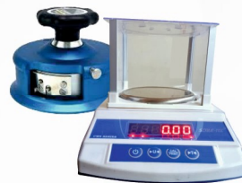
GSM WEIGHING BALANCE WITH ROUND CUTTER