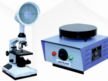
CARBON BLACK DISPERSION TESTER