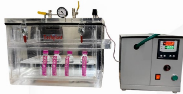
VICAT SOFTENING POINT (VSP/HDT) APPARATUS