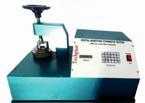
DIGITAL BURSTING STRENGTH TESTER