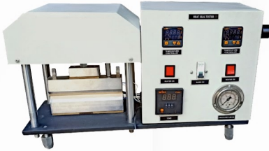
HEAT SEAL TESTER