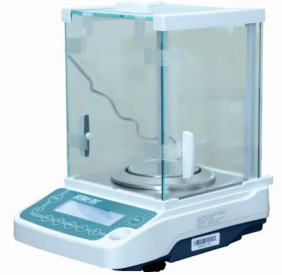
DIGITAL DENSITY WITH MICRO BALANCE