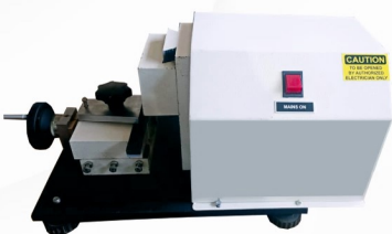
MOTORIZED NOTCH CUTTER