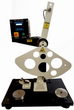
IZOD / CHARPY TESTER