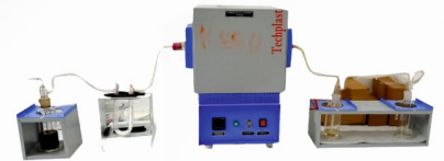
CARBON BLACK CONTENT TESTER