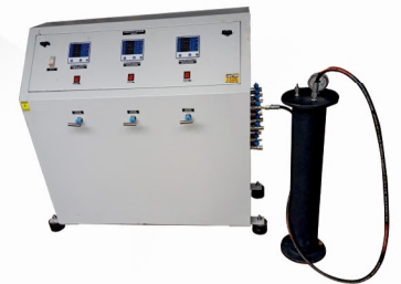
DIGITAL HYDROSTATIC PRESSURE TESTER