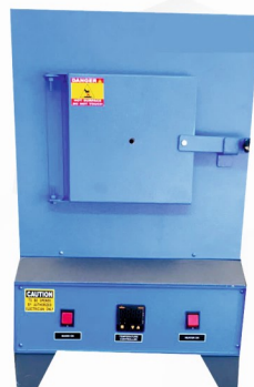
MUFFLE FURNACE (ASH CONTENT TESTER)